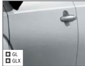
Silky Silver Metallic