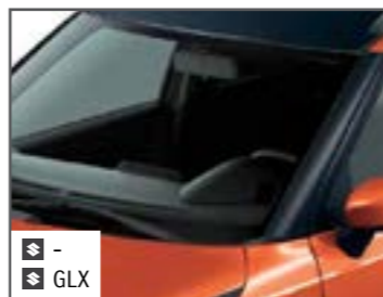
Lucent Orange & Midnight Black