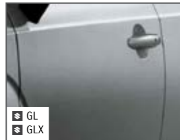
Glistening Grey Metallic