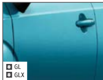
Turquoise Blue Pearl Metallic