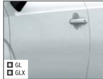
Arctic White Pearl