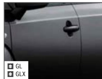
Midnight Black Pearl Limited