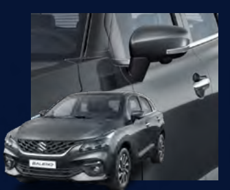
GRANDEUR GREY PEARL METALLIC