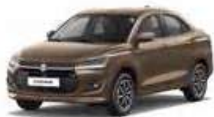
NUTMEG BROWN PEARL METALLIC