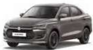
MAGMA GRAY METALLIC