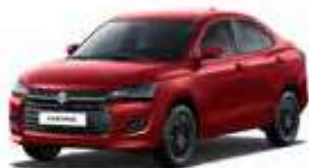
GALLANT RED PEARL METALLIC