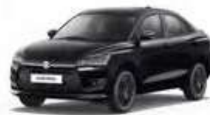
BLUISH BLACK PEARL

All care is taken to ensure the accuracy of this brochure at the time of print approval. Specifications, features, prices and model availability may vary from those specified and may change without notice. Always consult your authorised Suzuki Dealer or refer to www.SuzukiAuto.co.za for the latest details on all models.