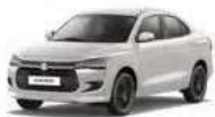
SPLENDID SILVER PEARL METALLIC