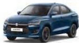
ALLURING BLUE PEARL METALLIC