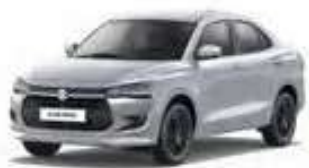
ARCTIC WHITE PEARL